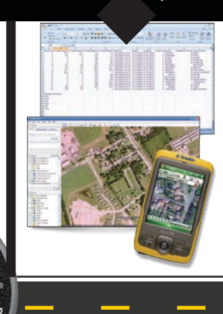
COMPREHENSIVE DATA 17 crucial data points